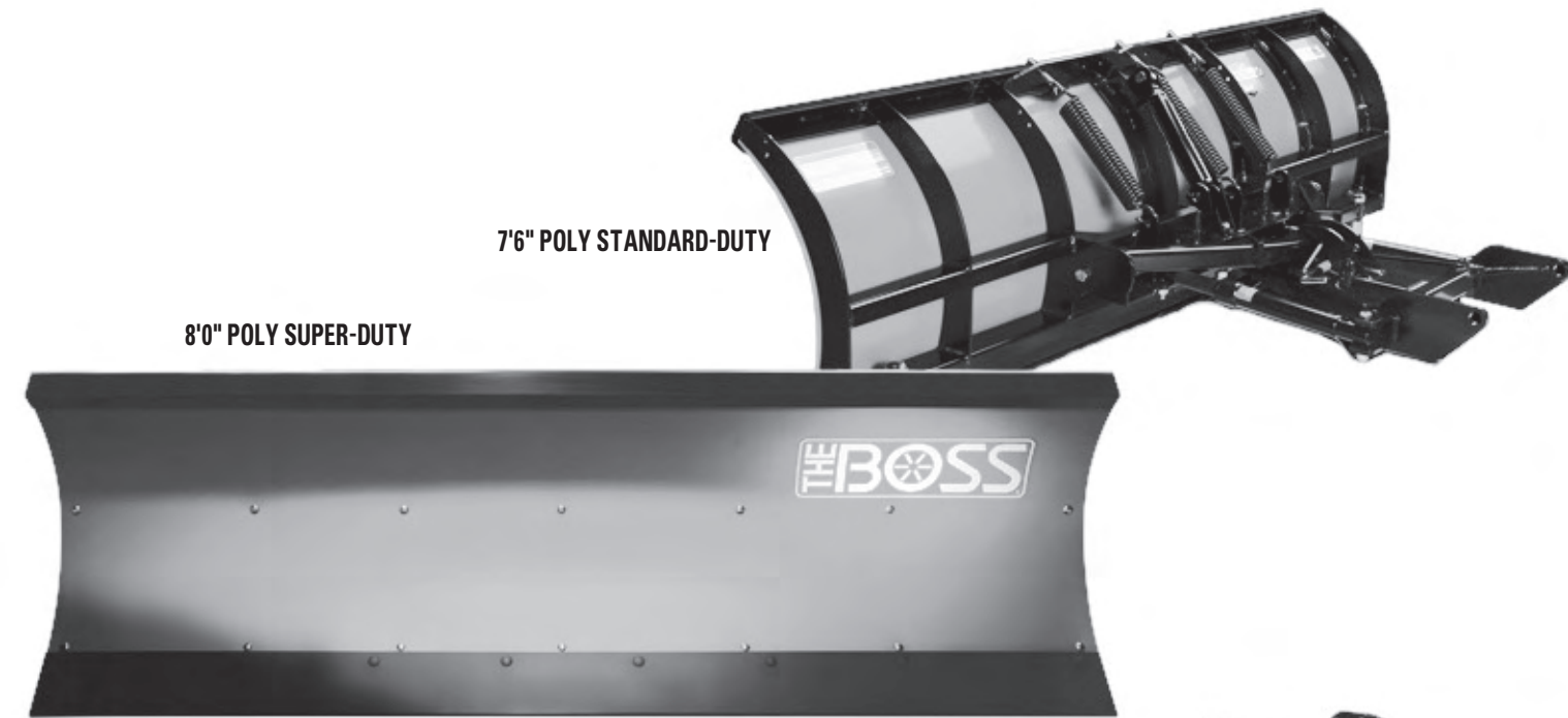
8'0" POLY SUPER-DUTY